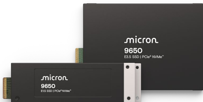
Micron 9650 NVMe SSD: E1.S 9.5mm and E3.S 1T

Solutions like the Micron 9650 help deliver the data for a performant, sustainable, scalable infrastructure.